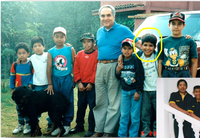
← 1998 Falcons of the Great King Boys' Club