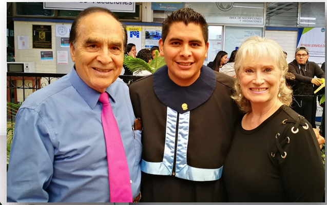
↑ One very proud, yet humble, young man. He is very artistically talented. We have some of his paintings hanging on the walls of our home.