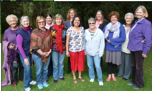
Below: Lady’s English-speaking Bible Study retreat