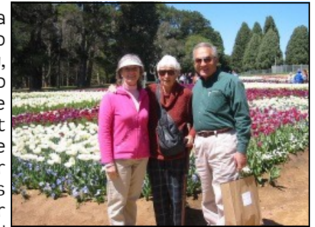
Taken in Australia in 2004