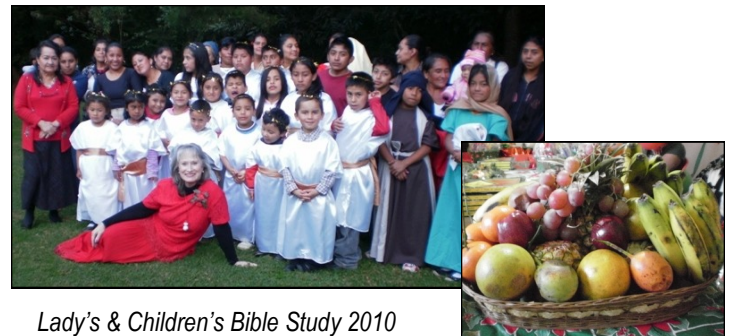
Lady's & Children's Bible Study 2010