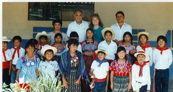
Top: One of the village schools for which we raised funds. They performed a special drama to express their gratitude.

From time to time we will share some pictures from our early years in Guatemala. It is fun to reflect and give God the glory for all He has done, all He is doing and all He is yet to do through this ministry, Ambassadors for Jesus Christ.