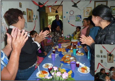
Women's Bible Study ⇨