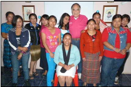
⇨ Señorita group

In addition to the four weekly meetings in our home, we also stay busy doing a lot of one-on-one counseling, discipleship and visitations to the families we minister to. Within that community, we deal with a lot of crisis and tragedies. We are alongside them to rejoice in their joys of a new marriage or new baby added to the family. We have helped a number of couples that were living together to get married, making their vows before God and the authorities of Guatemala.