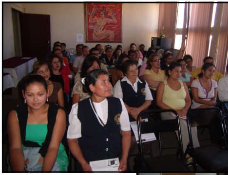
Character presentations for the employees of the National Penitentiary System—three different presentations in two days at two different locations.

Thanks to some specific donations for prison ministry, we were able to respond to an urgent call at a critical time.