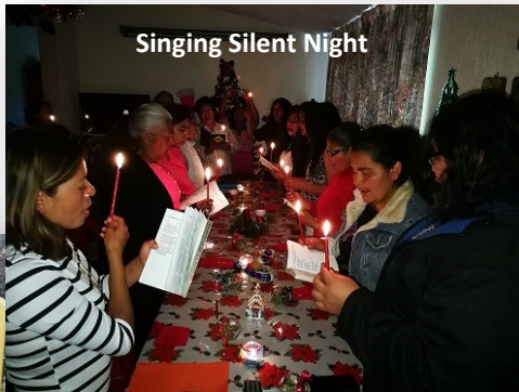
Singing Silent Night

We served 60 Christmas tamales to the ladies and children the day we celebrated the Lord Jesus' birth. The ladies were tightly squeezed in the "Upper Room" before it was expanded.