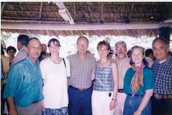
← This group picture was taken at Santo Tomas (similar to the U.S. Camp David) where the Rotary Club was invited for lunch.