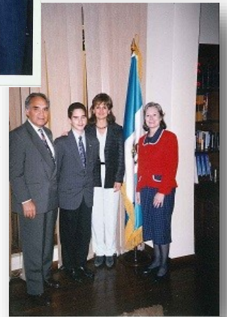
This was taken in → First Lady Patricia de Arzu's office at the Presidential Palace.