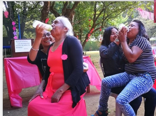
Racing to finish their baby bottle.