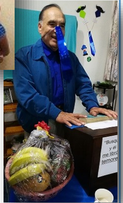
(right) Art having fun at the Father's Day party.