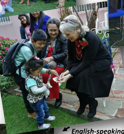
Each child and each one of the ladies in the Spanish-speaking Bible Study received a Christmas gift.